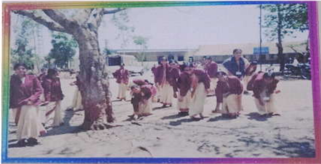
Gram Swachhata Campaign at Dumberwadi, Otur