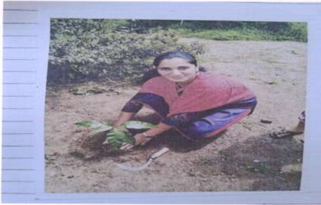
Tree Plantation Activity at Home During Lokdown