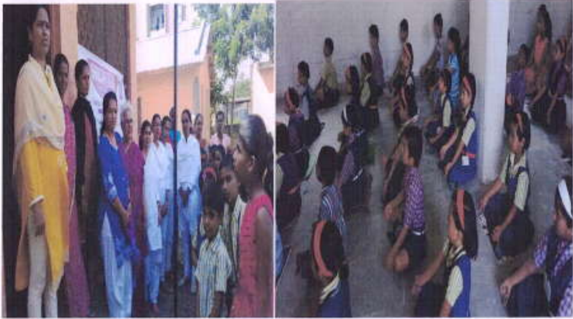
Yoga with Dumberwadi Primary School Children