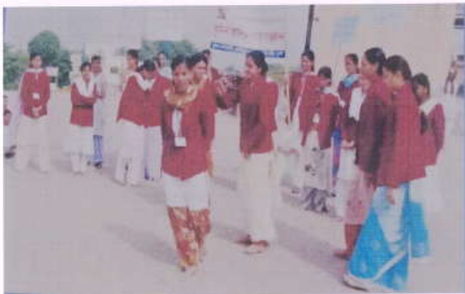
RashtriyaEktaDiwas Street Play