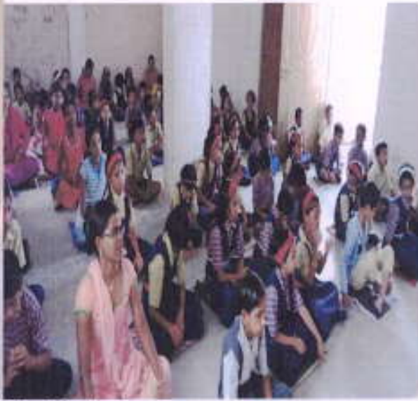
Teaching Tribal Students