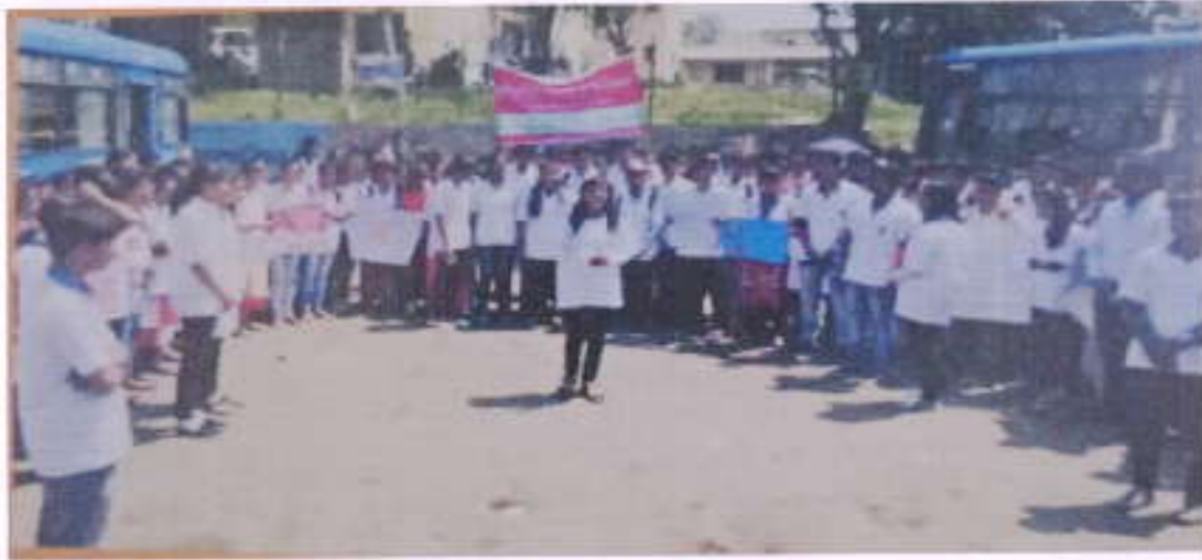
Right of vot