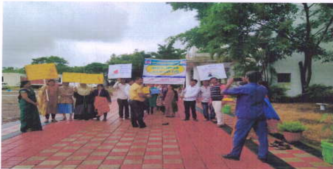
Health Awareness Rally