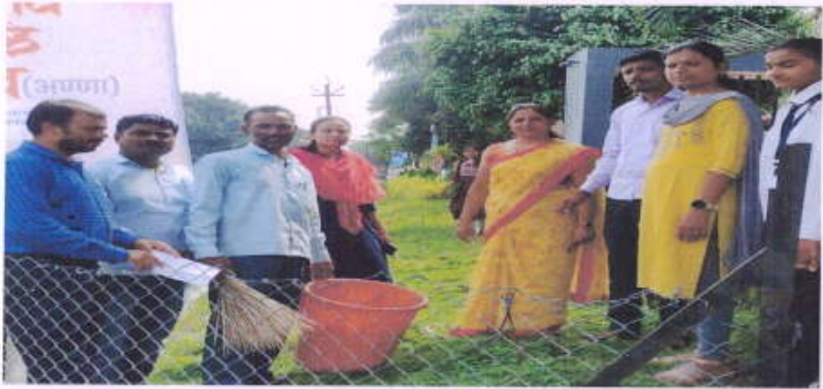
Cleanliness Program ,Dumberwadi