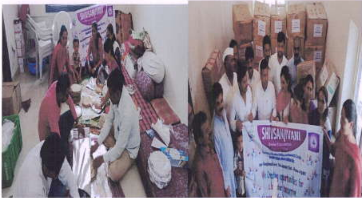
Flood relief Campaign for Kolhapur flood victim