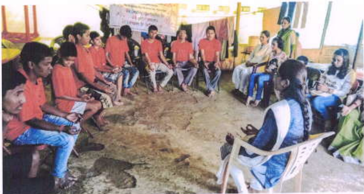
Visit to Special Children Institute