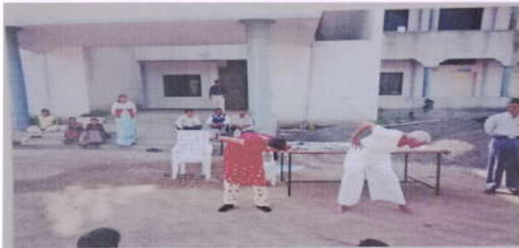
International yoga Day Celebration in Dumberwadi