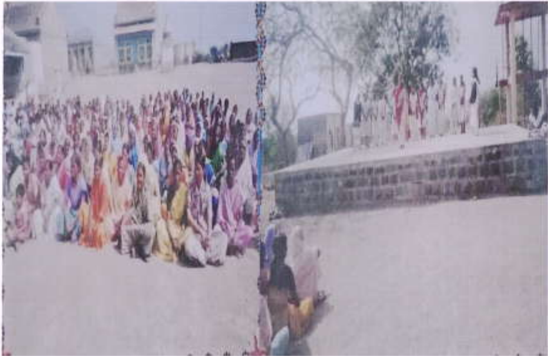
Health and hygiene Guidance For Female: Street play