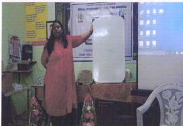
Mental Health Awareness program

Students actively participated in the lecture and learnt a lot through hands-on learning. Stress Management about Mental Health Awareness program on organized a highly effective program in collaboration with Shivsanjivani Social Foundation.