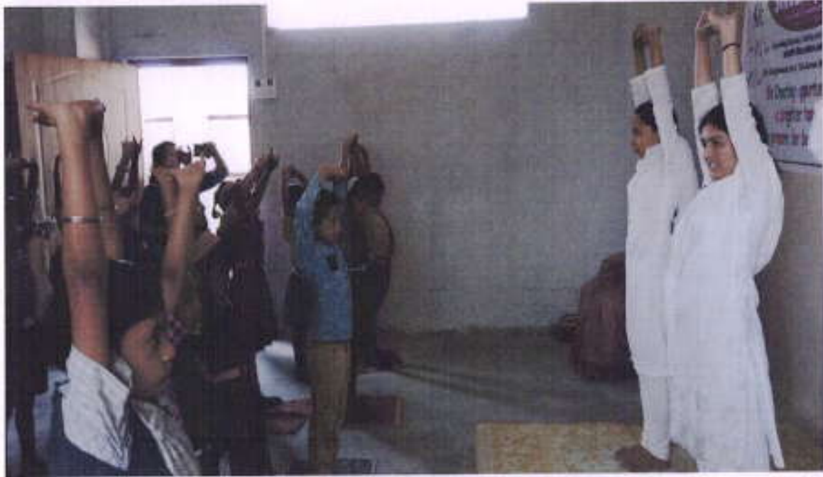
Yoga with Primary School Children