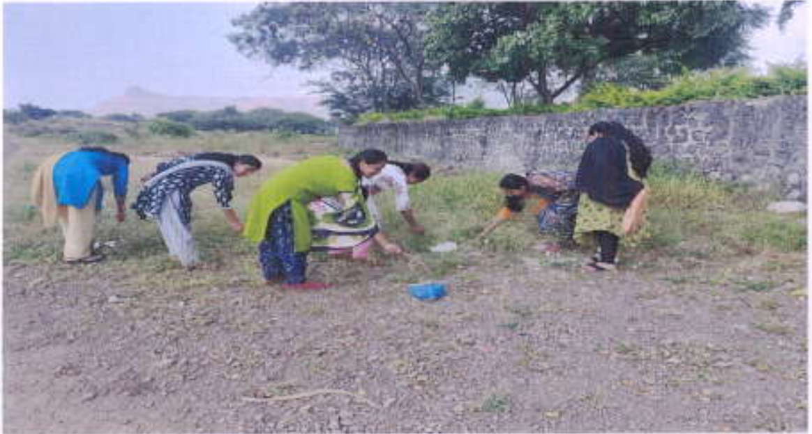
Cleanliness Campaign at Kaplidraswer temple