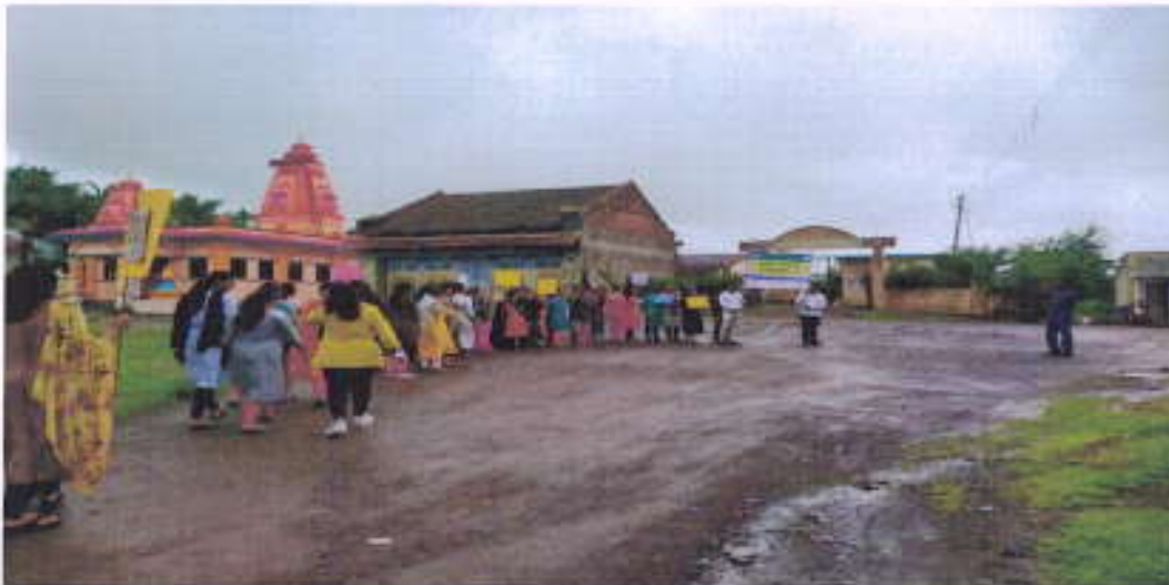
AIDS awareness Rally